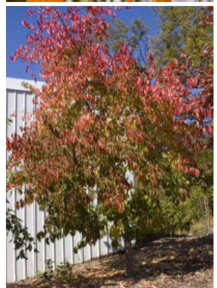
From top to bottom: seed capsules, fall color, and plant habit.