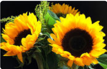
#51. Orange Cutting