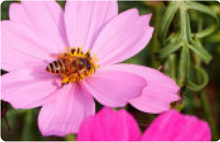
#48. Garden Mix