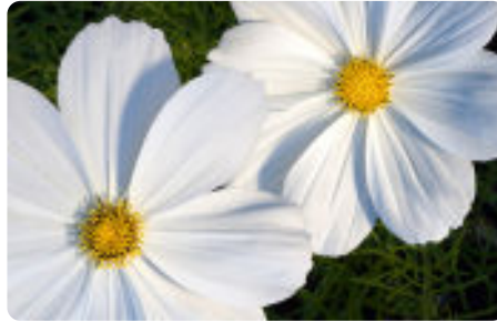
#49. Garden White